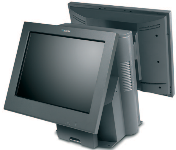
Shown: Independent customer display (12" display) delivers customer information and digital, multi-media merchandising (optional)