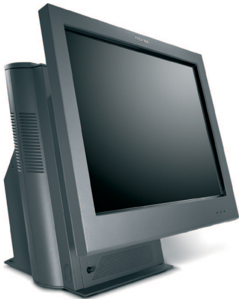
Shown: Toshiba SurePOS 500 Model 570