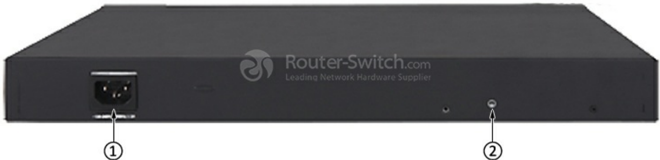
Figure 3 shows the back panel of HPE JG961A.