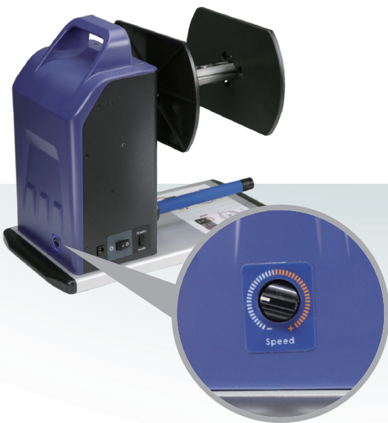
VR (Speed Adjustment)

Depending on the user's requirements, the rewinder can rewind "inside or outside" label rolls.