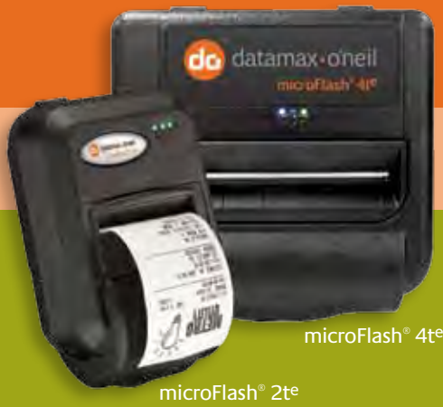
microFlash® 4t e