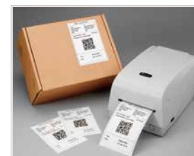
> Cutter mode

*Maximum Default Delay Time to Sleep (minutes): 5