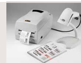
> Standalone mode with scanner