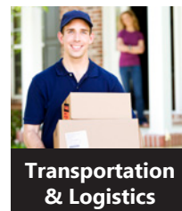
Transportation & Logistics