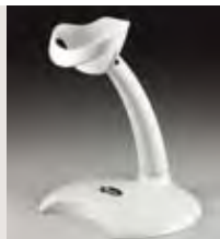
> AS-8000 stand