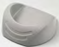
> AS-8000 holder