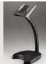
> AS-8120 stand